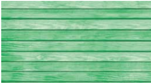
FrameGuard Coated Wood